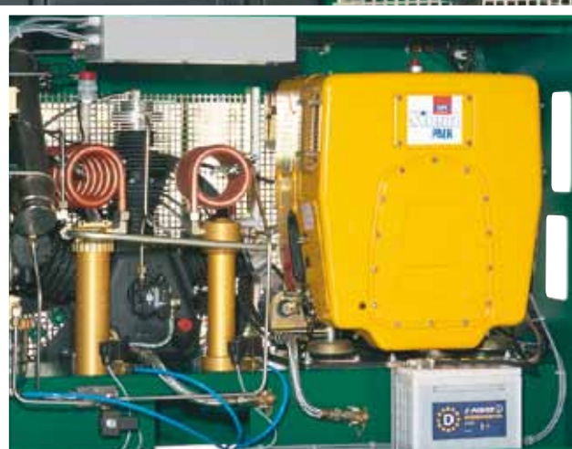
LW 450 D Rear view

LW AMERICAS 3005 NW 25th Avenue Pompano Beach, FL 33069 Phone: +1 (954) 462-5571 eMail: info@lwamericas.com Internet: www.lwamericas.com